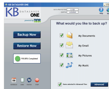
Simple, intuitive user interface with backup scheduler

Client software supported on: 32- or 64-bit XP, Vista, Windows 7 Memory: at least 128 MB Disk Space: at least 100 MB free Network Protocol: TCP/IP